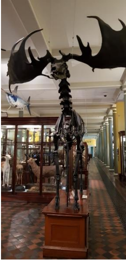
The Irish elk ( Megaloceros giganteus ) or Irish giant deer.

The most astonishing room of the museum is in the ground floor, where there are displayed Irish animals, and here you can admire the notably skeletons of giant Irish deer. The Irish elk ( Megaloceros giganteus ) or Irish giant deer, is an extinct species and is one of the largest deer that ever lived. The Irish elk lived in Ireland in the Pleistocene epoch between 11,750 BP and 10,950 BP.