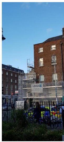
Oscar Wilde statue and his house, under restyling.

During the afternoon as soon as I had some time, I visited the most important Dublin Museums. I really liked the Natural History museum. It's a small museum that encompasses outstanding examples of wildlife from Ireland and the far corners of the globe, some to be seen today and others long extinct including a complete Dodo skeleton and a very rare Tasmanian wolf prepared as a mounted taxidermy specimen.