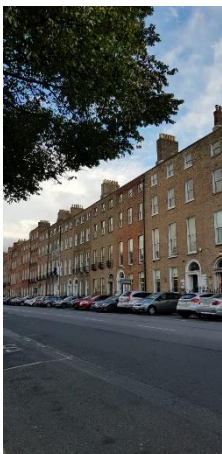
Typical Georgian buildings in the Dublin centre.

The school was in the centre of the city in a typical Georgian building of the 19 th century.